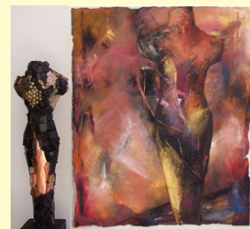
"Women in Stone VI" Tricia Grame

For details and updates on upcoming Branch Programs, see our website at http://www.aauw-da/org/program.html