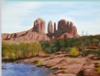
Sedona in Autumn