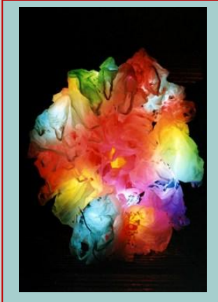
Cornucopia, 2008 Neon and plastic bags Bill Concannon