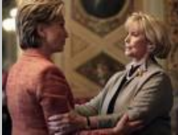
Lilly Ledbetter with Hillary Clinton

Lilly Ledbetter is perhaps the best-known face of pay equity. She worked for nearly two decades at the Goodyear Tire & Rubber Company in Gadsden, AL. Despite receiving top performance awards, Ledbetter discovered that she had been paid significantly less than male co-workers with the same job. After her November 1998 retirement, she filed suit under Title VII of the Civil Rights Act of 1964 and was awarded back pay and other remedies in a jury trial. The U.S. Supreme Court's 5-4 decision not only erased Ledbetter's award, but also left women, minorities, and others in Ledbetter's situation with virtually no recourse to pay discrimination.