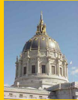
City Hall, San Francisco