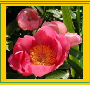
Peony in garden