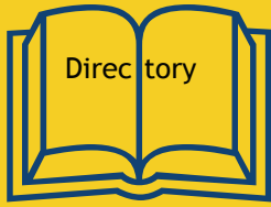
Membership Directory Errata