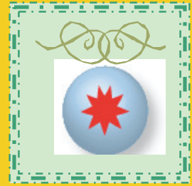
Holiday Party December 8, 5:30 P.M.