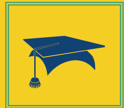
College Opportunity and Affordability Act (H.R. 4137)