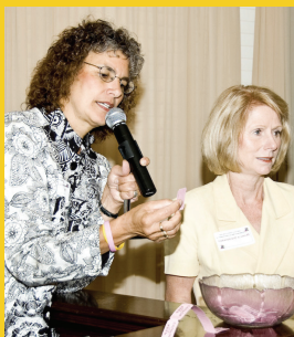
"And the winning number is..."